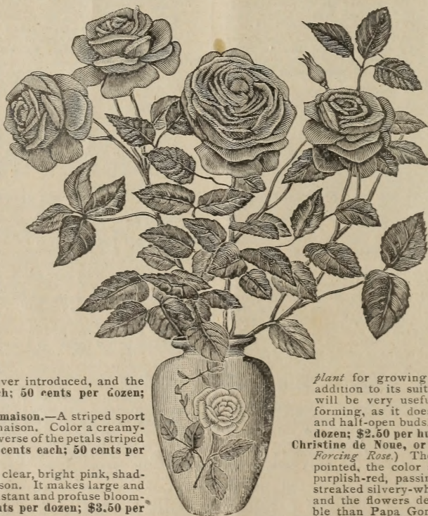
BEAUTY OF STAPLEFORD.

Belle Seibrecht. —A truly superb Rose. Color imperial